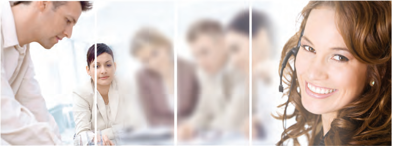
Panasonic KX-NT400, KXNT400, KX NT400, kx-nt400, kx nt400, kxnt400