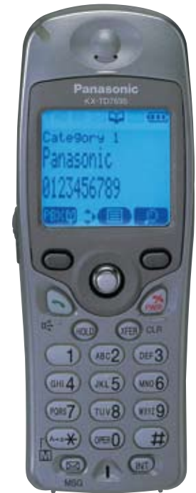
KX-TD7695 Compact Model