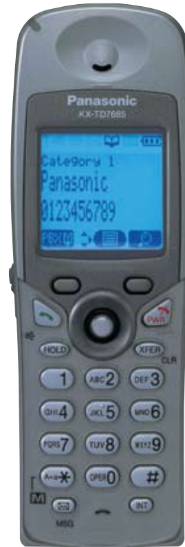
KX-TD7685 Standard Model